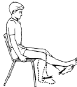
Ice Position 15 minutes 2-3 x per day